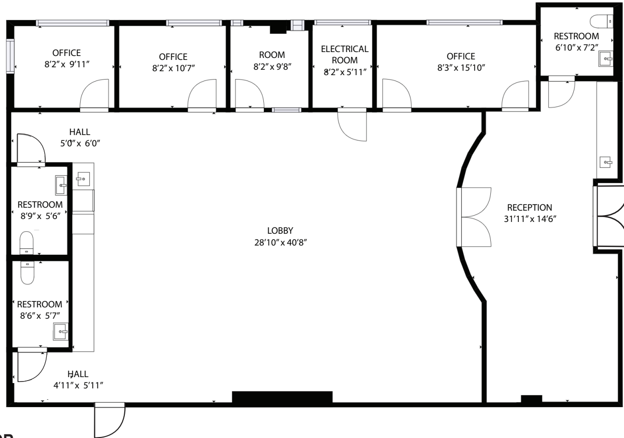
FIRST FLOOR KEY PLAN